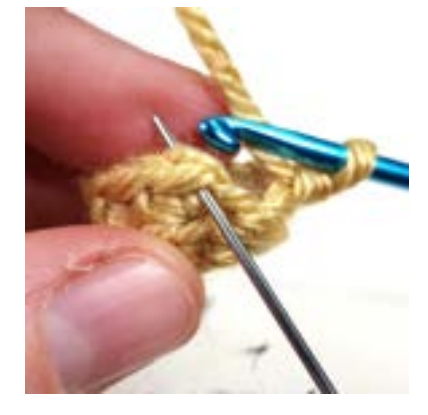
Rnd 4: Sc in all sts around. DO NOT join rounds. (8 sts)

Rnd 5: One sc in first st in rnd (this gives a more even edge); SOCKET is complete.